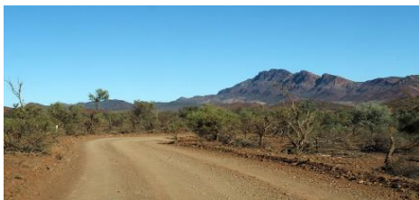
Moralana Scenic Drive