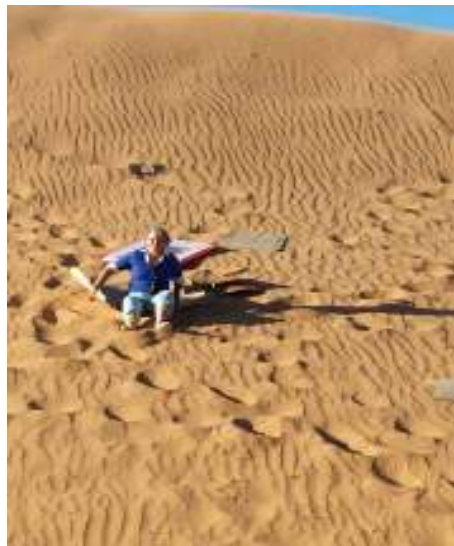
Fun on the Perry Sandhills !!—Wentworth NSW