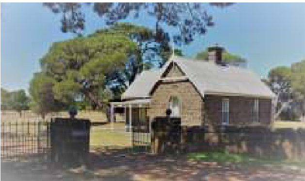
The Gatekeeper's Lodge at the Woolsthorpe Road entrance