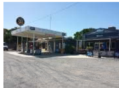
Hattah Roadhouse with original store to left

The original shop, with house at the back, will close.