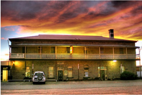
Great Northern Hotel Marree

We explore the historic town Marree, at the start of the Oodnadatta and Birdsville Tracks. Passing through one of Australia's most fascinating and diverse regions, the Oodnadatta Track closely follows a major Aboriginal trade route, the original Overland Telegraph Line and the old Ghan railway line. We travel through the Mound Springs on the rim of the Great Artesian Basin and stop to visit The Bubbler and Blanchecup springs.